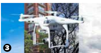
ImageBrew Adds Synthetic Backgrounds