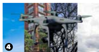
ImageBrew Adds Atmospheric & Lighting Effects